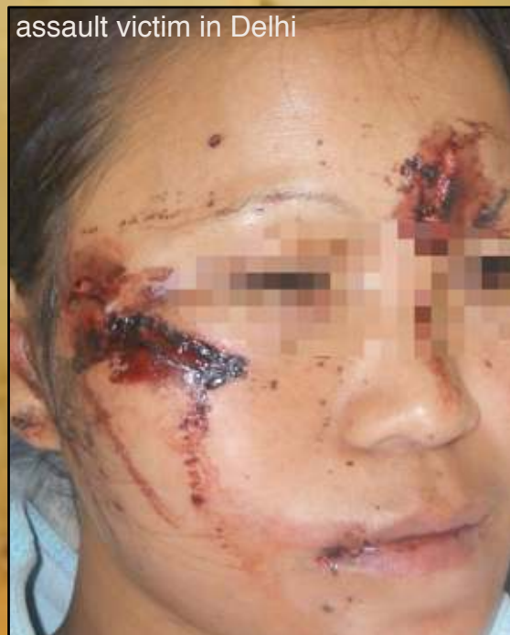
assault victim in Delhi

for cows. Moreover, it is said that the young refugee girls are getting involved in the sex trade as they have no other way to survive. At their wit's end, some refugees even go to pawn shops to pawn their UN certificate or FRRO cards to borrow money at a very high interest rate (such as 20%). The situation is truly troubling beyond our imagination and a worse crisis is threatening us as never before.