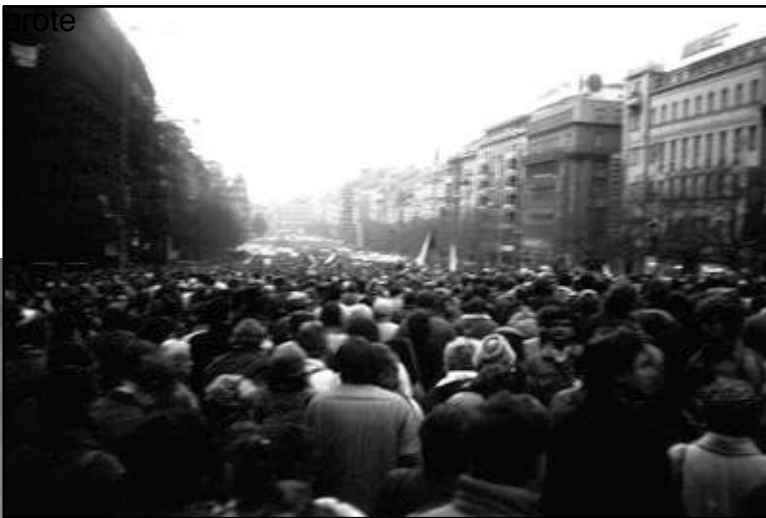
The Velvet Revolution: protests in Prague.