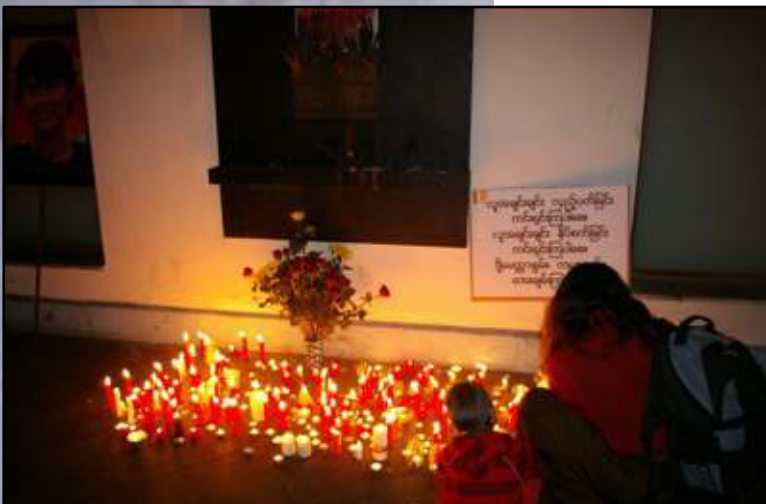
Remembering the Saffron Revolution in Prague.