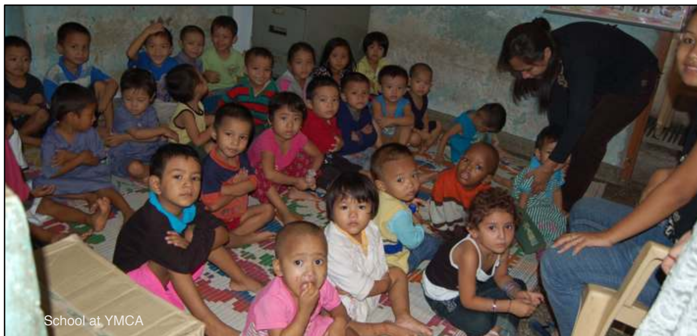
School at YMCA

During the Saffron Revolution in 2007, monks were forced to push beyond their religious boundaries and lead Burma's second uprising. Most educated youth were either arrested or forced to flee tyranny. It is difficult to imagine another revolution in this context. The big question for everyone is whether the Burmese refugees in exile can produce the necessary number of educated individuals to rebuild the nation. Though everyone is aware of the real situation and the regime's dubious new policies, one must also admit the fact that a transition is taking place in Burma. And Burma is