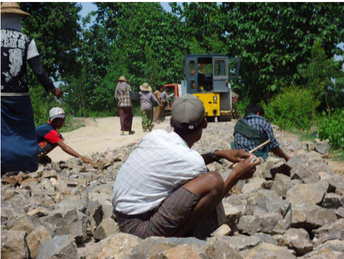
A road under construction near Alaungdaw Kathapha National Park, near Kani, Monywa. This particular road was built through a formerly protected area and will link India's Imphal City and China's Kunming.

throughout the 90s. Under the guidance of the ICC, the Cambodian-run body for developing the Angkor region—the Authority for the Protection and Safeguarding of the Angkor Region (APSARA)—secured the necessary legal framework for the hotel zone, in the form of a sub-decree in 1995, and set about purchasing the land. However, 12 years after the initial ZEMP recommendations, the project has failed to materialize. In early 2005, rather than being a space of luxury hotels and landscaped gardens, the zone is little more than a grid of roads and kilometers of wire fencing. 88